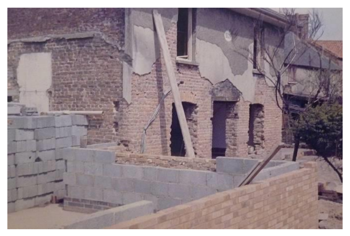
Fig.2 The meeting house during the 1966 refurbishment

2.2. The building and its principal fittings and fixtures